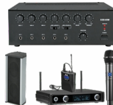
AMPLIFIER WITH MIC